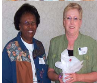
Passing on the "Friendship Ball!"