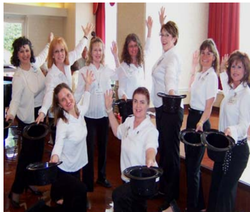
Hospice Staff salute the volunteers!