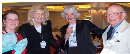
Volunteers enjoy good food and great company!